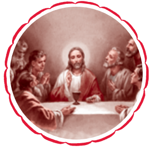
5. Institution of the Eucharist For active participation at Mass.