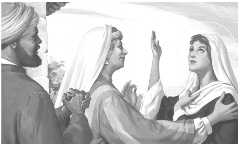
Mary visits Elizabeth and Zechariah.