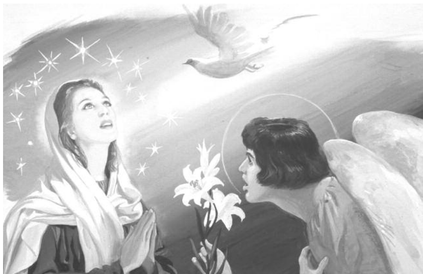
The Angel Gabriel greets the Virgin Mary.

After six months, the Angel Gabriel was again sent by God to a humble virgin at Nazareth, in the province of Galilee. The virgin's name was Mary and she was betrothed to a man named Joseph of the house of David. The angel greeted her in the words of the "Hail Mary." He announced to the holy virgin that she was chosen to be the mother of God and that she would have this Child by the power of the Holy Spirit. He also told her of the son soon to be born to her cousin Elizabeth.