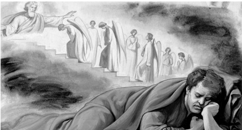
Jacob dreams of a ladder between heaven and earth.

When Esau found out that Jacob had received their father's blessing intended for himself, he became very angry and Jacob had to flee to Mesopotamia. During his journey Jacob had a vision in which God promised him the land on which he was lying, and that from him the Messiah would come.